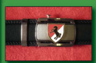
#10 Belt, $30.00