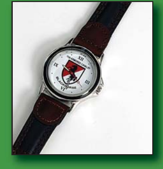
#5 Blackhorse Watch w/Leather Band (men's only) $35.00