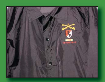
#43 Windbreaker, black w/snap front & BH Insignia & VN Ribbon, $35.00