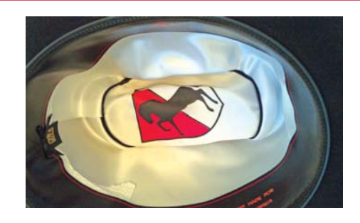
Cavalry Hat $225.00 (Item #9)