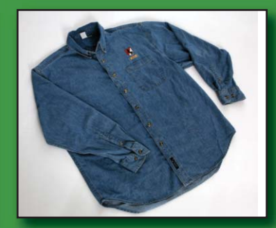
#41 Blue Dress Shirt, w/BH & VN Ribbon $32.00