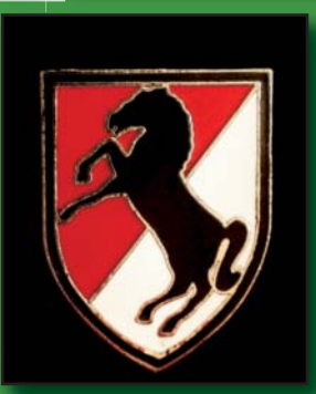
#17 Blackhorse Pin $5.00