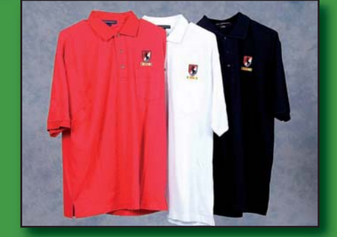
#40a/b/c Golf Shirt, w/BH Insignia & VN Ribbon, red/white/black $32.00