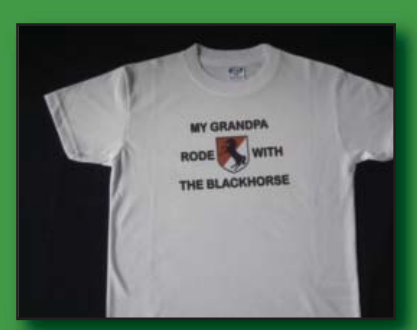
#36. T Shirt, "My Grandpa Rode With The Blackhorse" (Youth sizes: S, M, L) $20.00