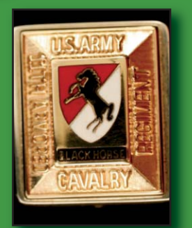
#23 Men's Ring, Gold & Silver $380.00