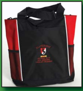
#16 Tote Bag, Embroidered $20.00