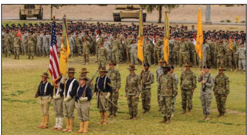
On February 2, 2017, the 11th Cavalry celebrated it's 116 birthday! Blackhorse troopers at Fort Irwin gathered on the parade field and sang Happy Birthday then fell into formation and sang the Regimental Song.