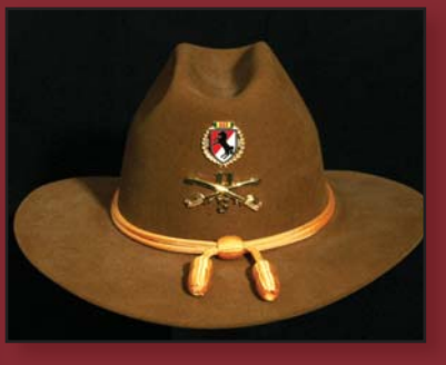
#9 Cavalry Hat $225.00