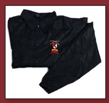
#43 Windbreaker, black w/snap front & BH Insignia & VN Ribbon, $35.00