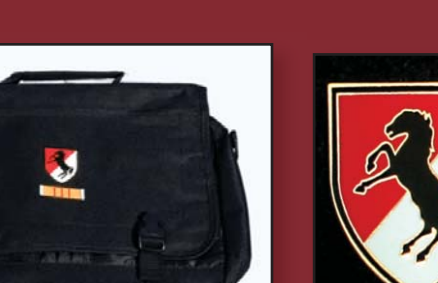
#15 Attache Case $30.00