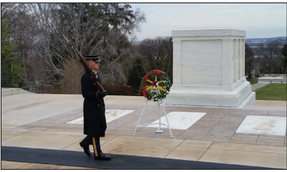
Blackhorse veterans laid a wreath at the Tomb of the Unknown Soldier at Arlington National Cemetery to mark the 116th birthday of the 11th Cavalry.

1st platoon vehicles were damaged or destroyed. Of the original 41 men, only the platoon sergeant was not a casualty. 16 Blackhorse Troopers were killed that day and 26 wounded. The enemy lost 30 men.