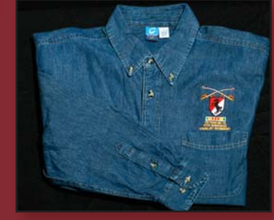
#41 Denim Shirt, w/BH & VN Ribbon $35.00