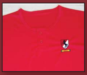
#36. Henley Sport Shirt w/ BH patch and RVN ribbon red in color, $28.00