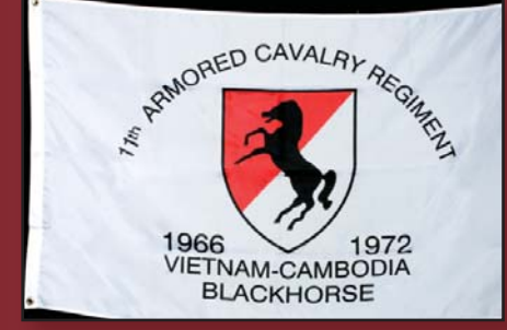
#11 Flag, Indoor/Outdoor $60.00