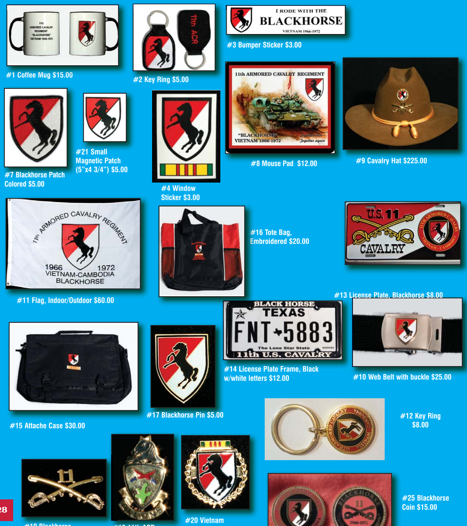
#19 Blackhorse Cavalry Pin $5.00