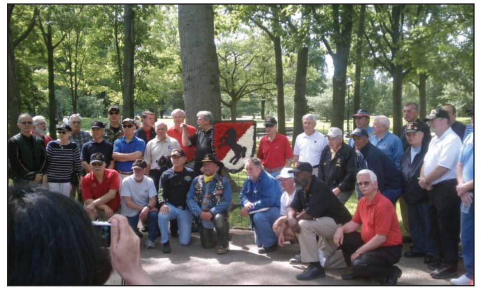
A Twenty Eight Year Tradition: Blackhorse veterans gather near The Wall in Washington, DC to remember their fallen brethren on Memorial Day 2013.

e had a very good turnout on May 27th for our annual Memorial Day wreath laying at the Vietnam Veterans Memorial. The weather was perfect.