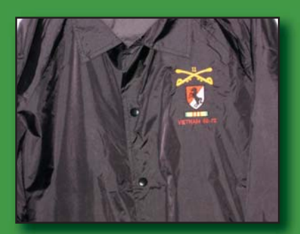
#43 Windbreaker, black w/snap front & BH Insignia & VN Ribbon, $35.00