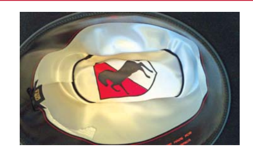
$225.00 (Item #9)