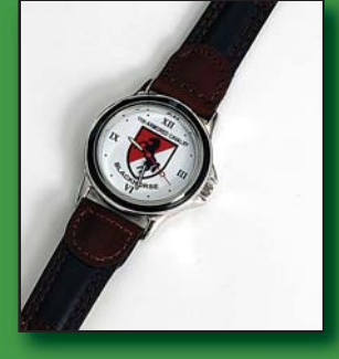
#5 Blackhorse Watch w/Leather Band (men's only) $35.00