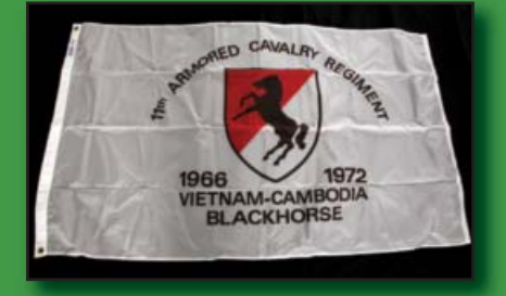
#11 Flag, Indoor/Outdoor $50.00