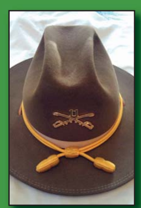
#9 Cavalry Hat $225.00