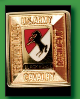
#23 Men's Ring, Gold & Silver $380.00