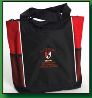
#16 Tote Bag, Embroidered $20.00