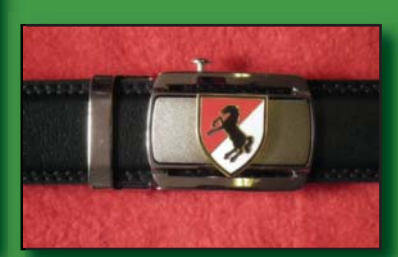
#10 Belt, $30.00