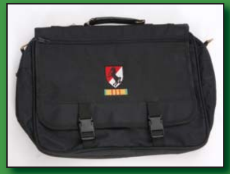
#15 Attache Case $30.00