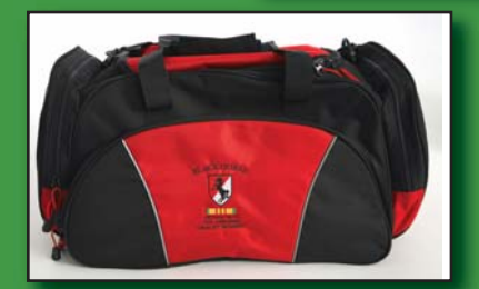
#22 Gear Bag, Red $35.00