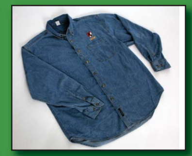
#41 Blue Dress Shirt, w/BH & VN Ribbon $32.00