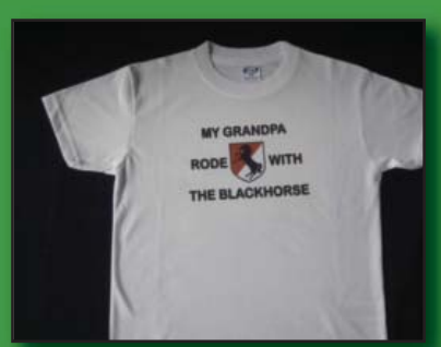
#36. T Shirt, "My Grandpa Rode With The Blackhorse" (Youth sizes: S, M, L) $20.00