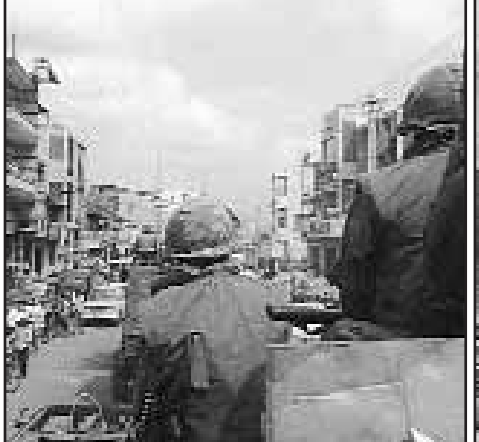
First Squadren takes a drive through downtown Saigon on way to Cu Chi.