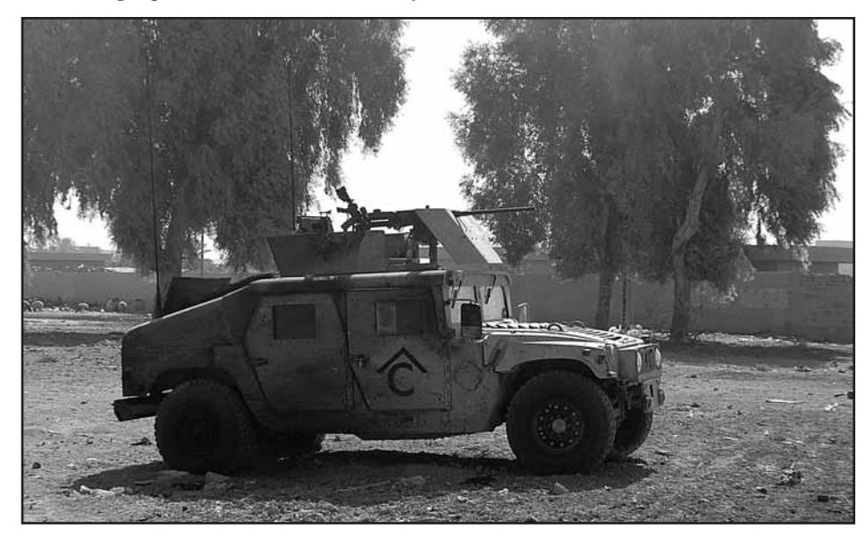
Troop B 1/11 ACR takes hit from Suicide Car Bomb (09-26-05)

Prior to leaving for Iraq my friends asked the same question after the first, which was, "Are you crazy?" They wanted to know how long we might have troops there and how long it would continue. My answer was standard. I can't give an opinion until I see it in person. All I have to go on is what we all see in the news and that is how someone else sees things from their perspective. As we all know from Vietnam news reporting, many reporters were never in the field. They would sit in some airconditioned hotel in Saigon and write stories from press releases from the military information officers based on field reports. I believe this is also the case in Iraq. Reporters are in Baghdad in the Green Zone where it is relatively safe embellishing stories from the field level military Public Affairs Officers (PAO's) as if they were on the scene. I personally witnessed this when the 1/11 ACR found the large weapons cache on September 25th, 2005. I was there and photographed it. There were no other reporters there. The PAO filed the report with the 3rd Infantry and their PAO forwarded it. It appeared the next few days in several publications. It was even picked up by a newspaper in Spain.