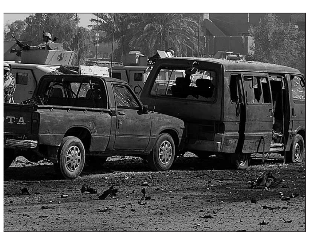
A VBIED (Vehicle Borne Improvised Explosive Devise) explodes against a B-Troop 1/11 ACR HUMMWV near Baghdad damaging nearby vehicles and injuring civilians. 11th ACR troops franticly work to save an Iraqi civilian in the background who died later. Although the HUMMWV gunner was burned on the face and wrist, he gave aid to the wounded before being treated himself. A schoolboy was rushed to the Hospital at Abu Ghraib Prison where he was treated for a shrapnel wound to the head and released the following day. (11th Armored Cavalry Regiment. 09-26-05)

The gunner was burned on the face and wrist in the initial blast but put his own injury second in line to assisting the injured civilians. This type of self-sacrifice was the norm throughout our experience with the troopers of the 11th ACR.