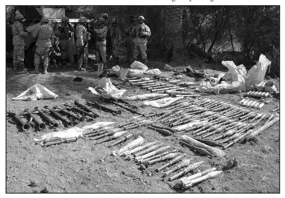
2nd largest Weapons Cache found to date by Troop B 1/11ACR on our 4th day in country. You would swear this was an old Vietnam photo. (09-25-05 near Abu Ghraib Prison.)