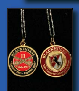
#29 Ladies Necklace $25.00