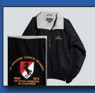
#42 Blackhorse Jacket, 100% Nylon $95.00