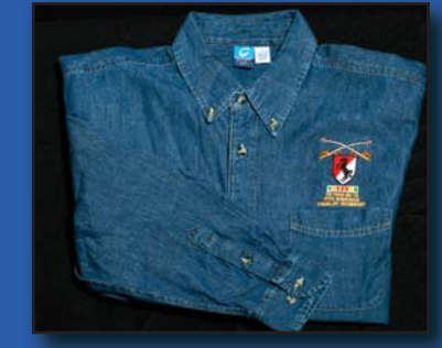
#41 Denim Shirt, w/BH & VN Ribbon $32.00