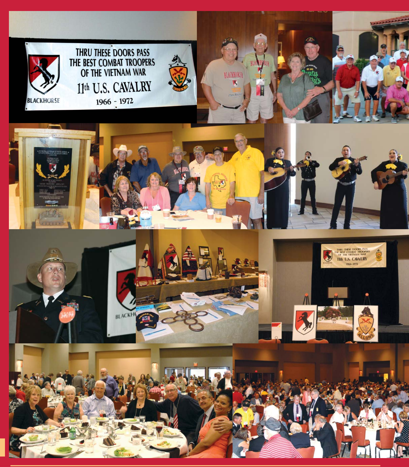
4th Quarter, 2016